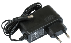
24 V 0.38 A power adapter